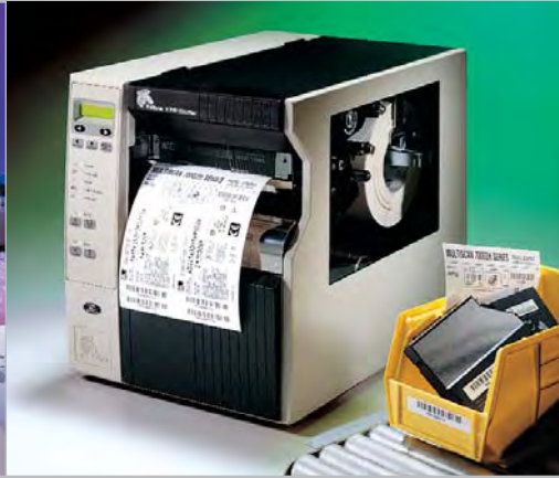
170XiIIIPlus™ 203/300 dpi

Label and liner width: 1.57"/40 mm to 5.51"/140 mm Ribbon width: 1.57"/40 mm to 5.1"/130 mm