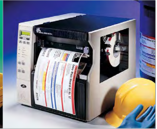
220XiIIIPlus™ 203/300 dpi

In North America, the 170XiIIIPlus has an RFID Ready option that allows you to upgrade to RFID technology in the future.