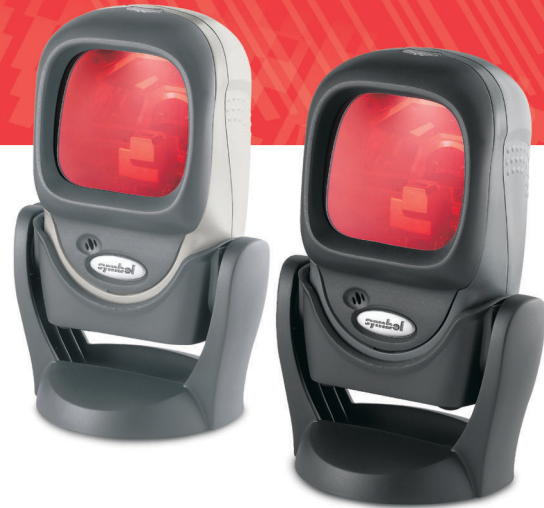
2005 Sunrise Date Compliant

In many applications, the feature-rich LS 9208 presentation scanner offers aggressive performance, maximum durability and optimal ergonomics to create a more productive POS environment. When you buy the LS 9208, you receive the added assurance of purchasing from Symbol—a company with proven solutions and millions of scanner installations worldwide.