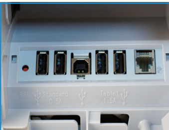
USB HUB for Peripherals and Charging